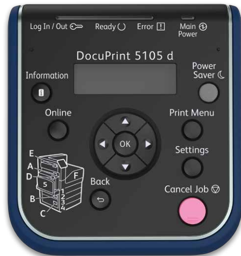
The simplified control panel of the DocuPrint 5105 d makes on-printer operations quick and easy.