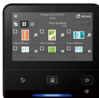
5-inch colour touch panel